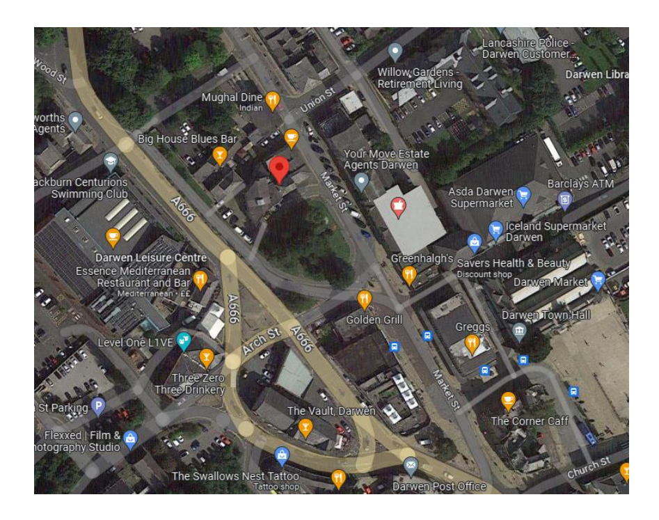
Figure 1: Google aerial view of the application site